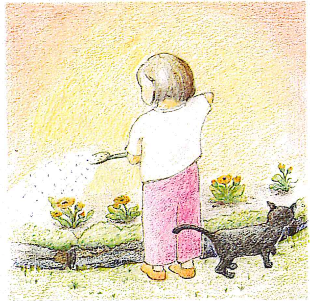
Imitating common, everyday tasks done by adults is important for healthy development.

Today, those of us who work with young children in a Waldorf environment are challenged to engage in a constant process of renewal. We must actively observe the children in our care, carry them in our meditations, and seek to work consciously and artistically to create the experiences that will serve their development. Our devotion to this task awakens us to the importance of self-education and transformation in the context of community. Our ongoing study of child and human development, our own artistic and meditative practices, and our work with