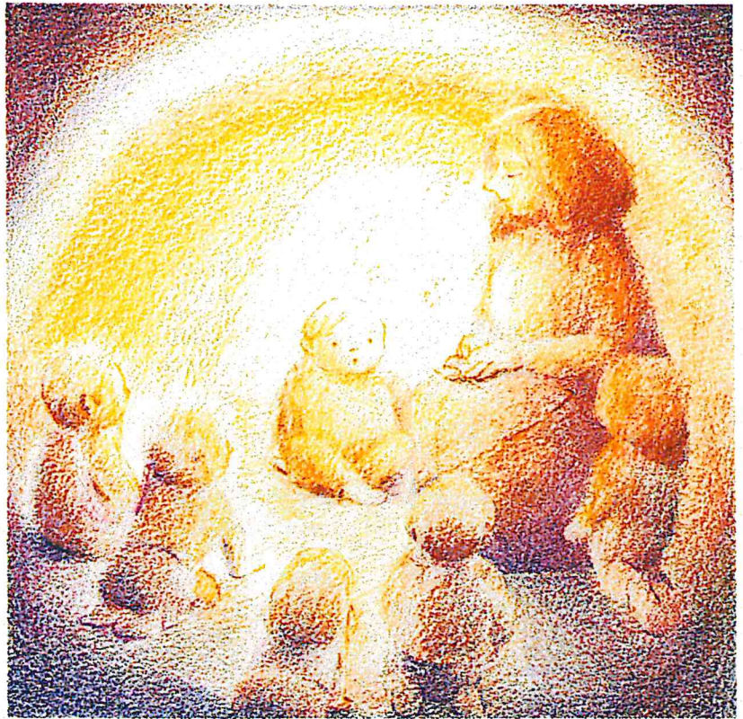
Stories told to children enliven and enrich their imaginations. Here children listen to the story of “Mouskin.”

In the early childhood class, the art of education is the art of living. The teacher is an artist in how