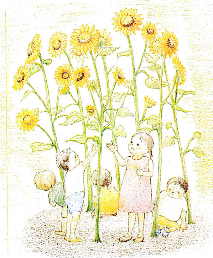
Small children need time in nature to experience wonder and joy there.