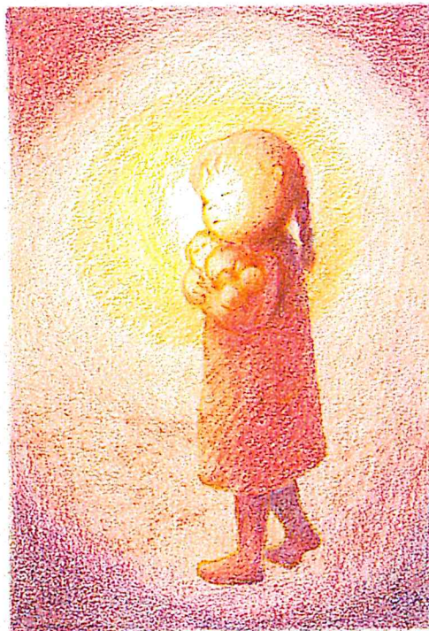
Free, imaginative play, such as this little girl playing "mother" with her doll, is an important activity for the young child.

Early experience of gratitude is the basis for what will become a capacity for deep, intimate love and commitment in later life, for dedication and loyalty, for true admiration of others, for fervent spiritual or